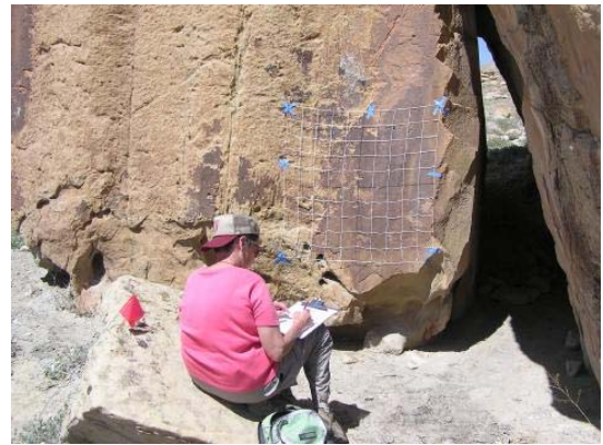
Working a string grid.