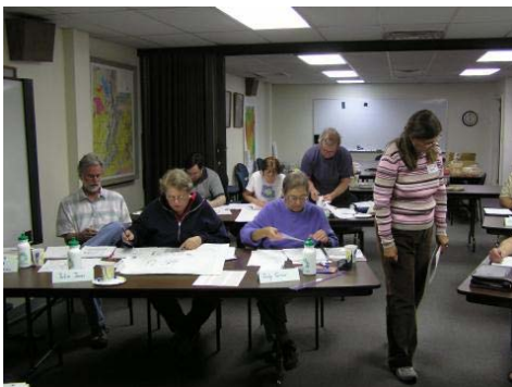
Inside sessions at BLM office.